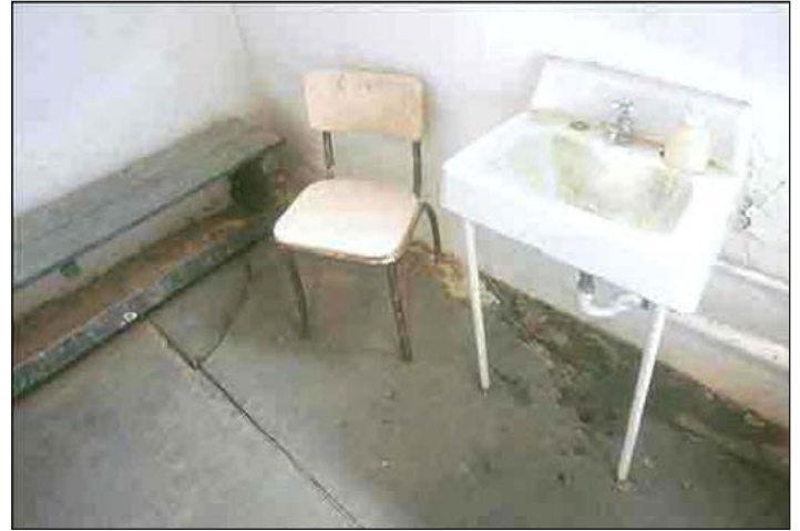
Shades of Peach

inhabited shelves and corners, and many photographic prints were propped against walls. There were two lop-eared house rabbits, scuttling about, plus Frazer the dog (I can't tell for sure what make of dog he was) and the garden welcomed all manner of wildlife, Anne burying chocolate buttons and peanuts under paving stones for visiting badgers.