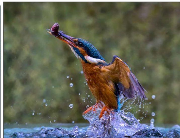
Kingfisher with catch