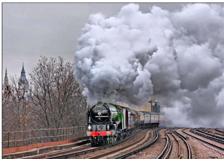
Cathedral Express leaving London

Being a natural history society we have a keen interest in nature photography and the highlight of the year is the keenly competed natural history pdi trophy. But our members have interests in all photography genres including sport, street photography, landscapes, portraits and still life.