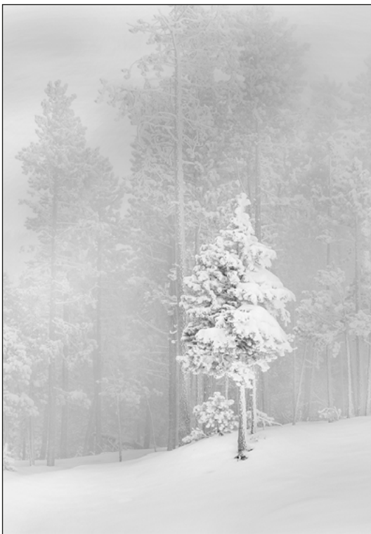
On the Edge