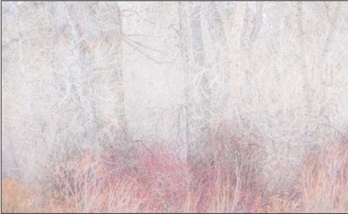
Winter in the Woods