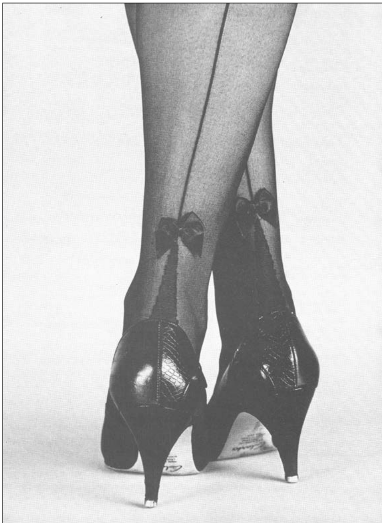
Commended Mono Print ~ Bow Legged